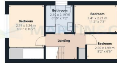
Floor 2 Building 1