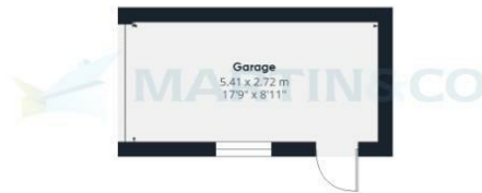
Floor 0 Building 2

Approximate total area (1) 91.4 m 2 985 ft 2 Reduced headroom 1.2 m 2 12 ft 2