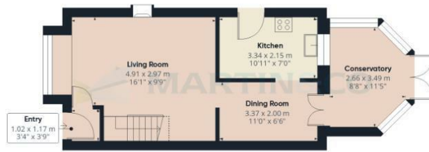
Floor 0 Building 1